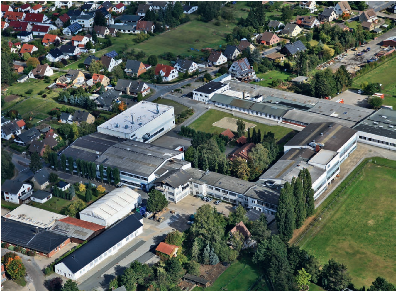
▲ Key Plastics Löhne is a company of Key Plastics headquartered in Livonia, Michigan (USA). Key Plastics is a manufacturer of plastic parts for the interior, body and engine compartment of vehicles.

fine exact switching points. All this is offered by the HB-Therm system in a simple and reliable way.“